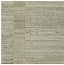
Natural Silk 99111